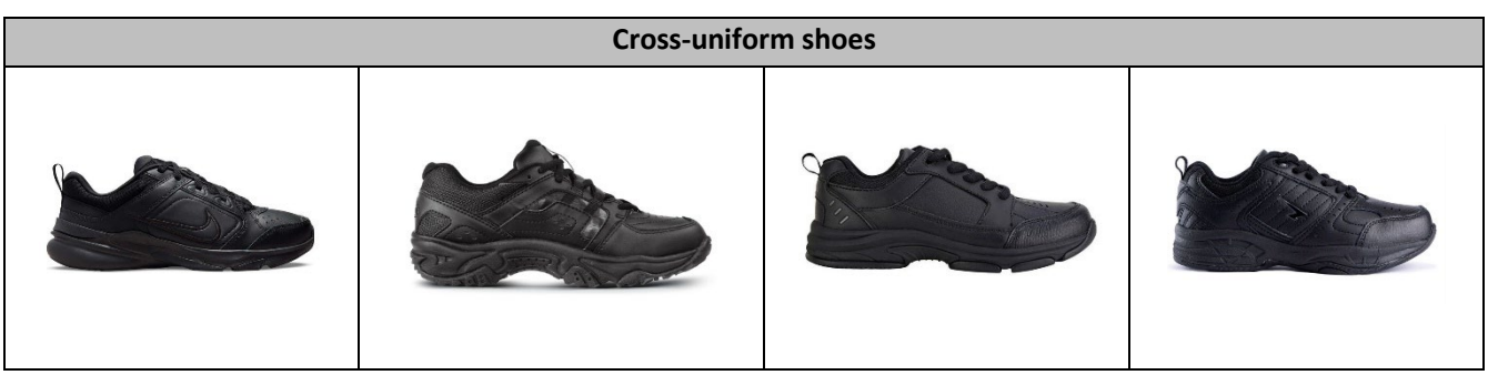
Years 10 – 12 Day Uniform