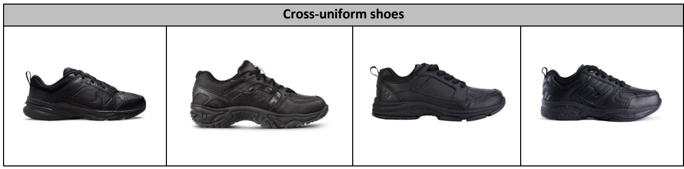
Years 7 - 12 Sports/Specialist Uniform

The Centenary SHS Student Dress Code stipulates that the sports uniform is worn with appropriate runners, joggers or cross trainers. In accordance with community feedback during the uniform consultation process, some leather plain black sports shoes could be considered suitable as a day uniform option also – images of shoes which would be considered appropriate for a dual purpose are shown below.