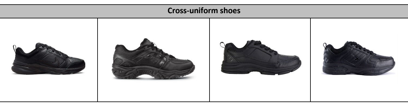
Years 10 – 12 Day Uniform